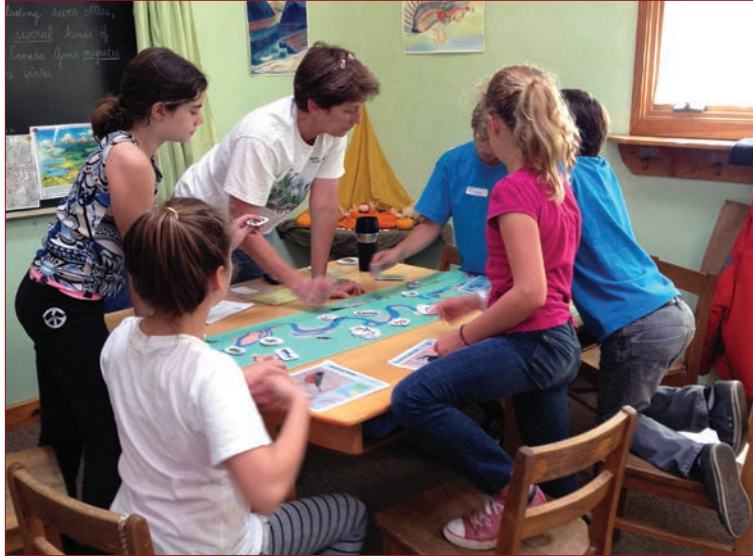
4th graders learning about bird migration.