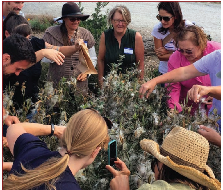
Milkweed plants in the Laguna Environmental Center landscape attract Monarch caterpillars and teachers during a recent habitat workshop. (Anita Smith)

During the 2013-2014 fiscal year, 252 volunteers contributed their time and skill in our restoration, education, and development departments. To all of our docents, guides, interns, tree planters, debris and weed removers, plant monitors, landscapers, special event and office support, Laguna Keepers and Team Prunus... we are grateful for your support.