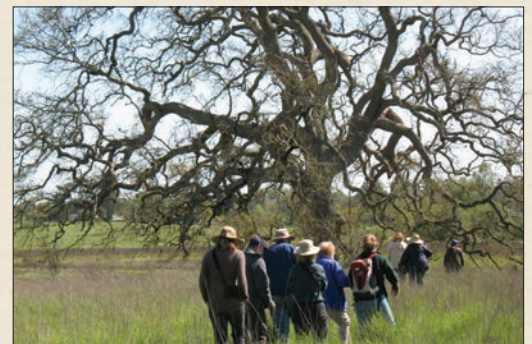
Education volunteers enjoying the Laguna. (Christine Fontaine)