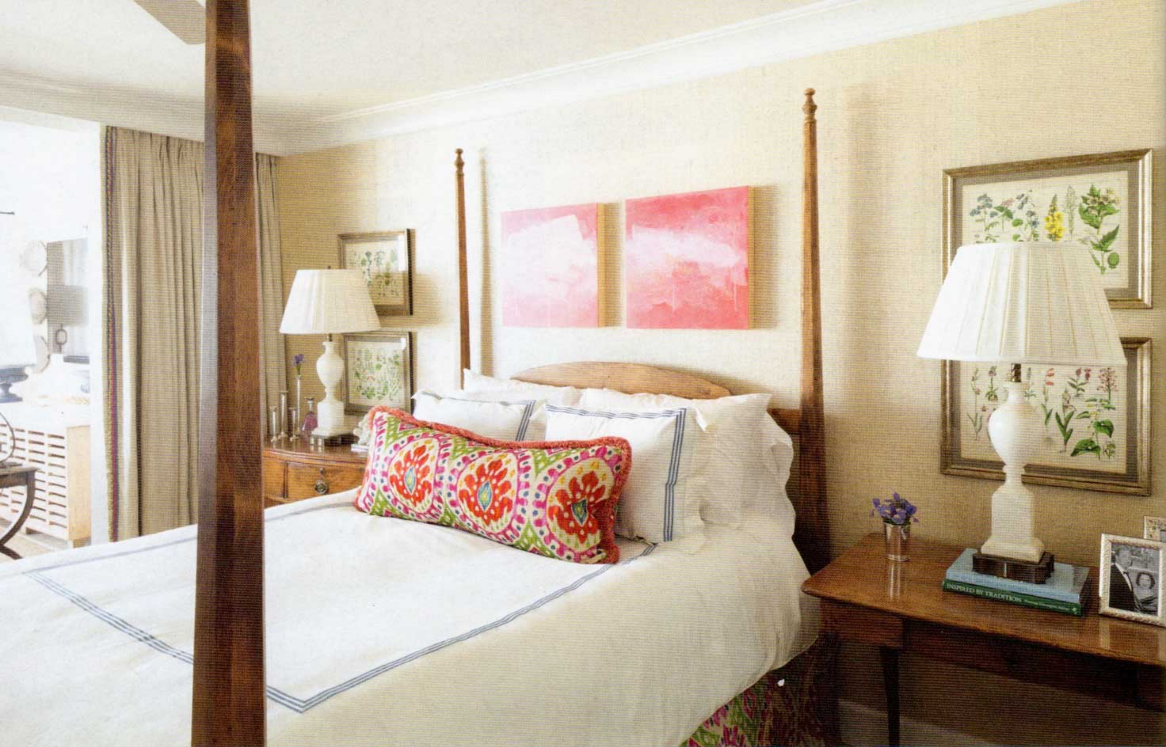
With two sons and no daughters, the wife “wanted a space that was more feminine than the rest of the home,” Will says. To give her the look she craved, Will enveloped the master bath (right) in a stylized trellis wallpaper and hung a grid of antique pink-and-green botanical prints. An acrylic chair, found at a local market and reupholstered in sizzling magenta, lends a mod top note. A bold print fabric for the master bedroom dust skirt and throw pillow (above) carries through the palette, yet the neutral backdrop alleviates the sweetness.