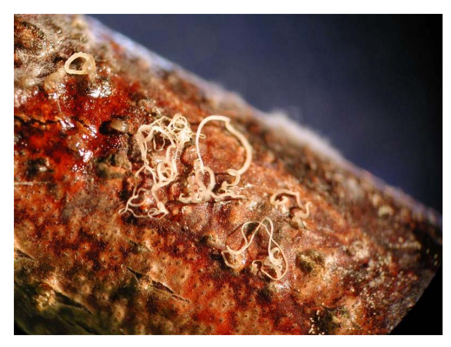
Figure 10. Tendrils of conidia held together by mucilage (cirri) exuding from pycnidia of Phomopsis amygdali on peach.