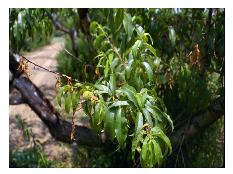
Figure 9. Shoot blight phase of constriction canker on 'Biscoe' peach. Low growing shoots located near the inside of the tree canopy appear to be infected at a higher frequency than shoots at other canopy positions. In addition to loss of fruit for the current growing season, shoot death exasperates tree pruning and training efforts to generate future fruiting wood.