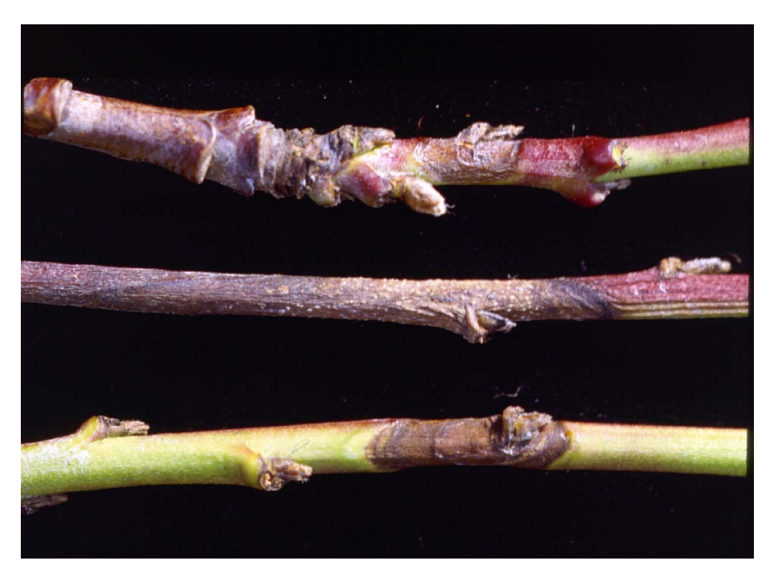
Figure 8. Constriction cankers on 'Jerseyglo' peach. Young cankers (top and bottom) and older canker (middle) are centered about the leaf node. Note slight constriction of twig diameter on bottom canker.

Uddin, W. and Stevenson, K. L. 1998: Seasonal development of Phomopsis shoot blight of peach and effects of selective pruning and shoot debris management on disease incidence. Plant Dis. 82:565-568.