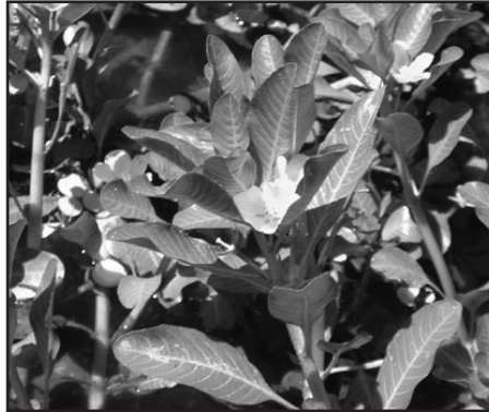
Ludwigia sp. (creeping water primrose)

Lepidium latifolium (perennial pepperweed) is a highly invasive herbaceous perennial introduced from Eurasia. Unlike Ludwigia, Lepidium can establish in a wide range of habitats including riparian areas, flood plains, wetlands and marshes. Lepidium has upright stems to 4 feet tall, with white flowers and an extensive creeping root system. Once established, Lepidium creates dense colonies that displace native vegetation and animals and is very difficult to remove because of its deep roots. If left unmanaged, both Ludwigia and Lepidium form dense stands that modify native habitat and decrease biological diversity, ultimately impacting the plants and animals we associate with the Laguna.