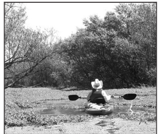
Kayaker obstructed by dense mats of Ludwigia

For more information about the Laguna Learning Center, visit the Foundation's website at: www.lagunafoundation.org .