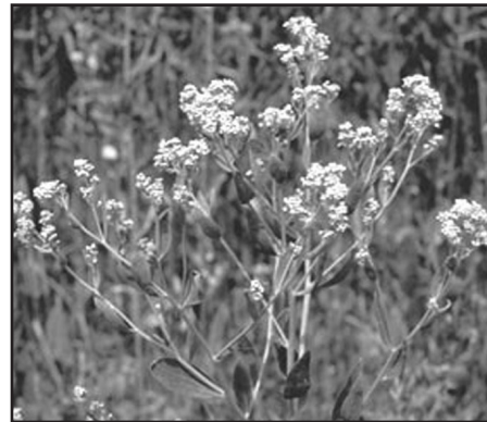
Lepidium latifolium (perennial pepperweed)