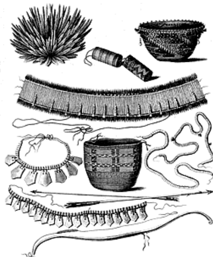
Artifacts that are representative of life in Coast Miwok and Southern Pomo villages.

to Point Reyes and inland to Petaluma, Sebastopol and Santa Rosa. Eventually, by the 1852 census, a group of 14 members remained. At its lowest point, the tribe endured a final insult as an Act of Congress, known as the Rancheria Termination Act, decided that the Coastal Miwok and Southern Pomo were no longer considered a "tribe" and put the Graton Rancheria in private ownership. This act effectively cut them from desperately needed housing, health and education funding. From these 14 remaining ancestors though, there are now well over 1000 descendants who eventually re-grouped to form a federation.