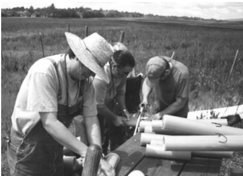
Agilent Technologies employees cutting tree shelters down to size for oak saplings.

Major funding and in-kind donations for the Middle Reach project have been