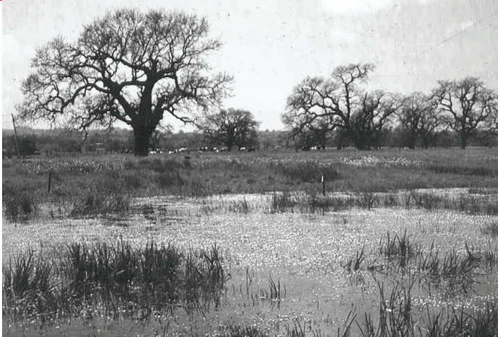
Rich biodiversity characterizes the Laguna's vernal pools, a habitat type found in only a handful of places in the world.