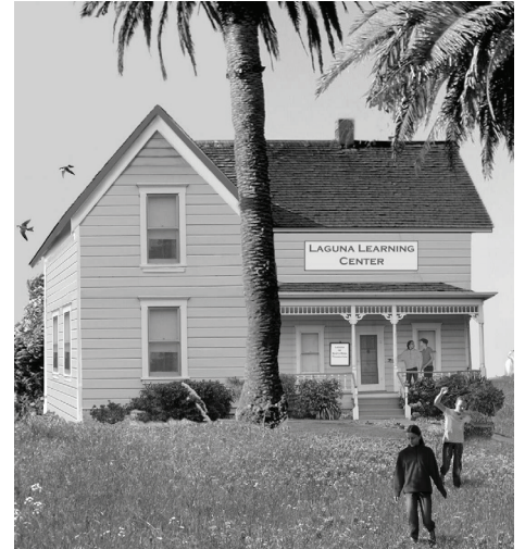
The Laguna Learning Center at Stone Farm

Last year, the Foundation approached the City's Board of Public Utilities to ask that the Foundation be allowed to lease