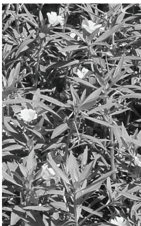
The invasive creeping water primrose Ludwigia hexapetala .

The scope of the problem—over 150 acres of solid Ludwigia in the two project areas where the problem is most pronounced—is enormous. The Foundation is currently securing funding for the interim control effort, which will begin in July.