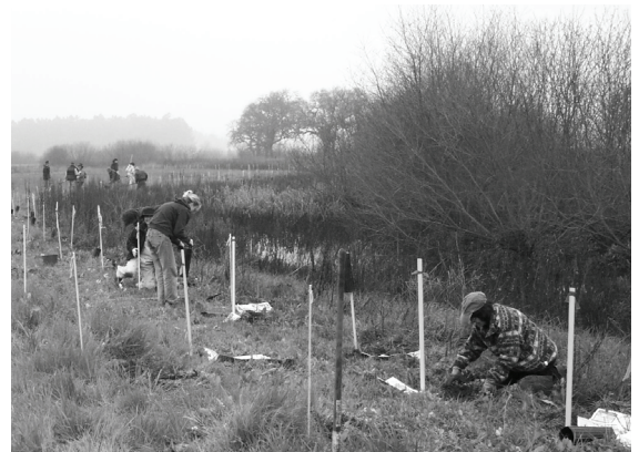
Volunteers of the Foundation's LagunaKeepers program plant oak trees in the Laguna